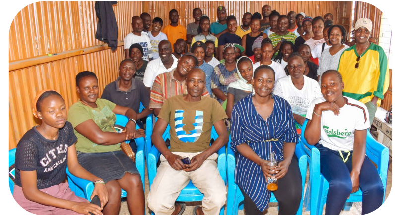
Community dialogue in Dandora Phase 3