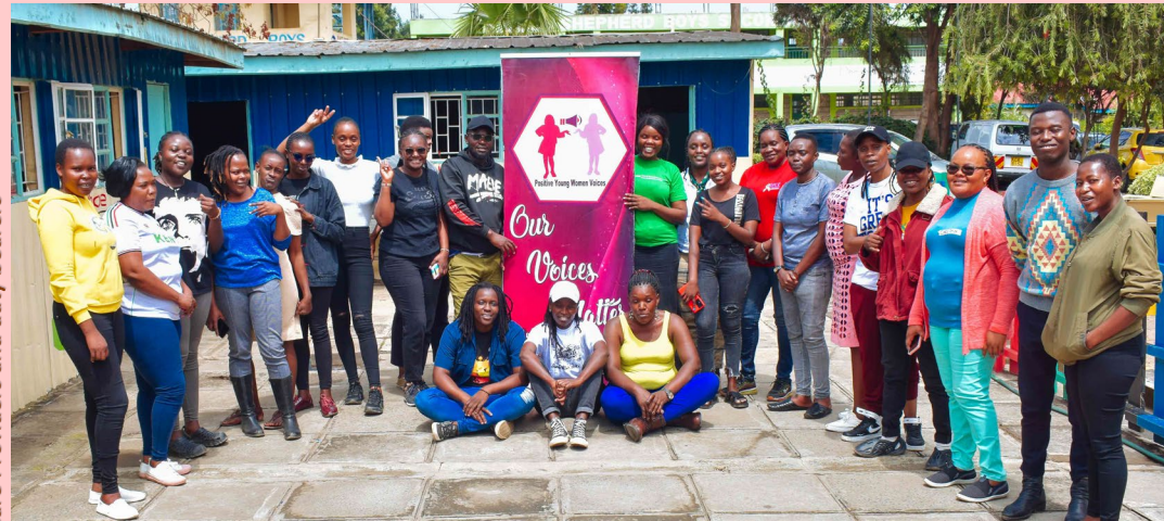
Engagements with Health Care Providers and duty bearers

As we shifted our focus to stakeholder engagements, the SRHR program conducted a successful dialogue with Health Care Providers from the 5 phases in Dandora to discuss and promote the diverse SRHR needs of lesbian, bisexual and queer persons in accessing quality healthcare without stigmatization. There were different outcomes from this session as we delved deeper into what Sexual Orientation, Gender Identity and Gender Expression (SOGIE) means. The session ended with an understanding from the Health Care Providers on the critical health needs of the queer community.