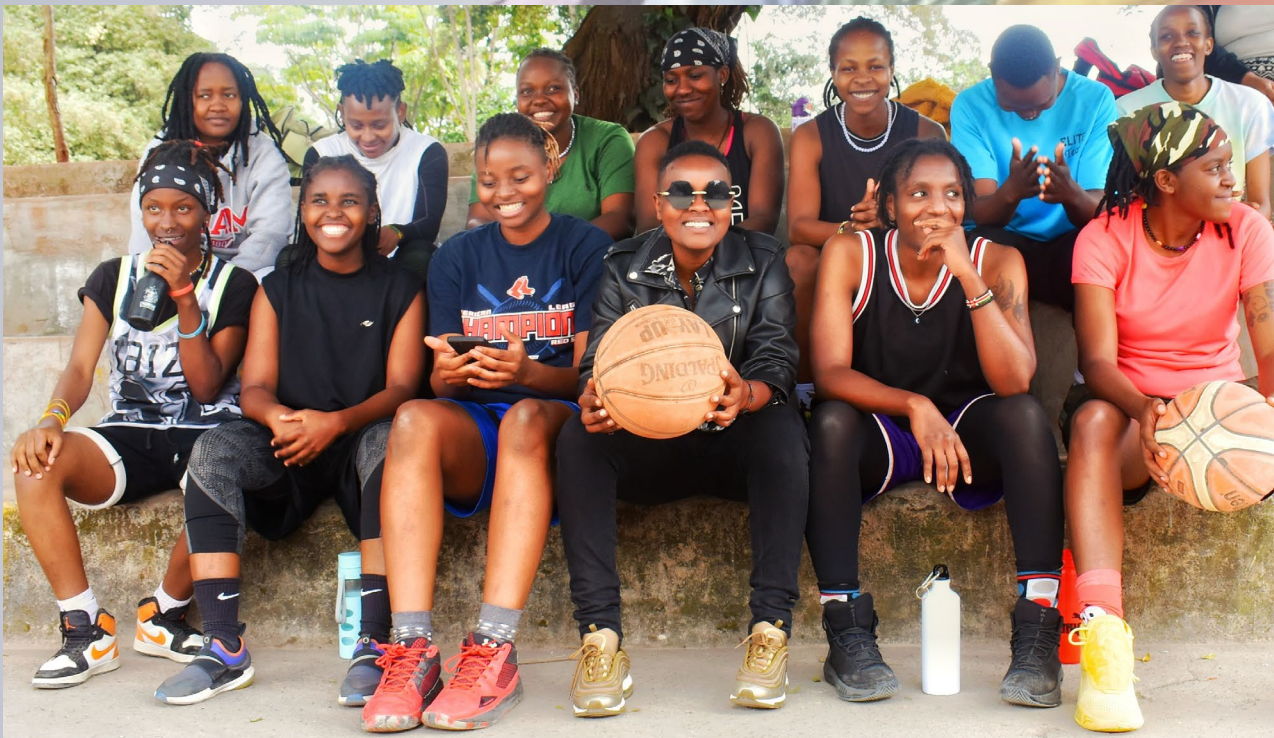
SOL BALLERS BASKETBALL TEAM

PYWV commits to addressing the health needs of the queer community among our right holders. There is a gap in accessing quality healthcare services for this group of individuals as they are not considered when policies and laws are being formulated and implemented. We sensitize the right holders on the effects of the existing retrogressive policies in exercising their human rights, in general, and linkages in accessing quality sexual and reproductive health and rights services.