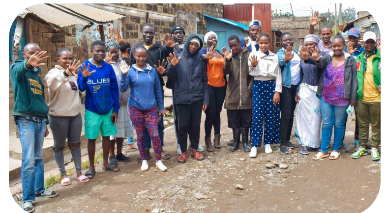
Community dialogue in Dandora Phase 4